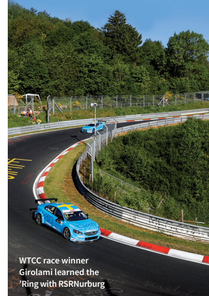
WTCC race winner Girolami learned the 'Ring with RSRNurburg

"For an amateur trying to learn, it's definitely important to start with a small car there."